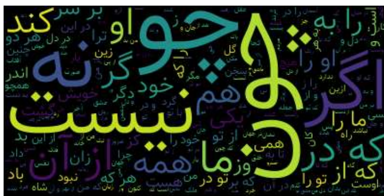
Figure 4. Word cloud of Persian poems corpus

was introduced by [14] and was based on the previous Word2Vec model [15]. The objective of the Word2Vec model was to represent words in a vector space in which semantically similar words are close to each other. Moreover, relationships between words are also captured in this representation model, with for instance Iran and Tehran having the same relationship as France and Paris. Doc2Vec is an improvement over Word2Vec, inasmuch as it allows documents to be represented as vectors.