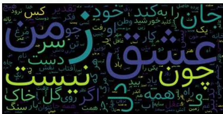
Figure 3. Word cloud of poems in Ghalamchi dataset.