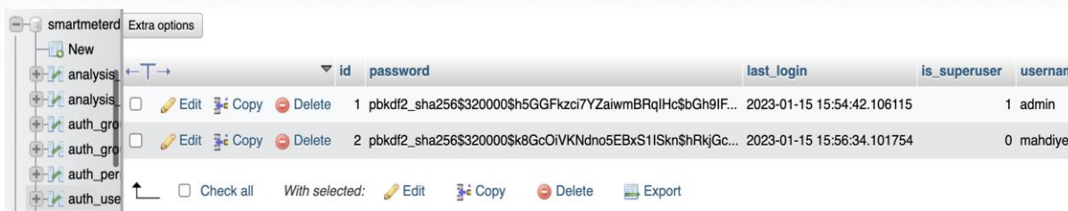
Fig. 4. Hashed password stored in database table