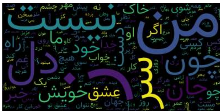
Figure 2. Word cloud of poems in Gaj dataset.

In order to answer thematic similarity MCQs, we first trained a Doc2Vec model on a corpus of Persian poems. The Doc2Vec language representation model