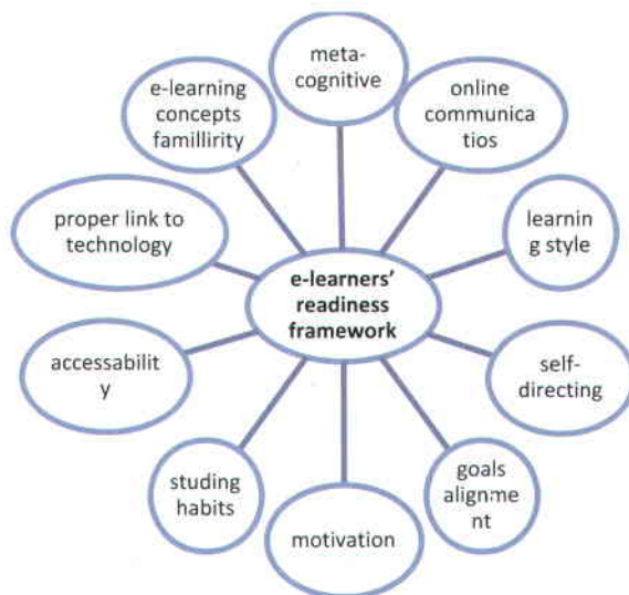
Figure 2. E-learners' readiness framework