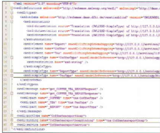
FIGURE 2 WEB SERVICE DESCRIPTION DOCUMENT

have exploited the XML-structure of web service description [22] and the position is determined based on the tree structure. This means that we obtain some sub trees for each word and the words are only meaningful in their assigned sub trees. This structure causes differentiation between "book" in the input parameter and "book" in the output parameter. So we call each word and its position pair as positional-term and denote it by pt(p; t) .